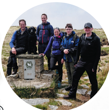
Reaching the letter box at Cranmere Pool.