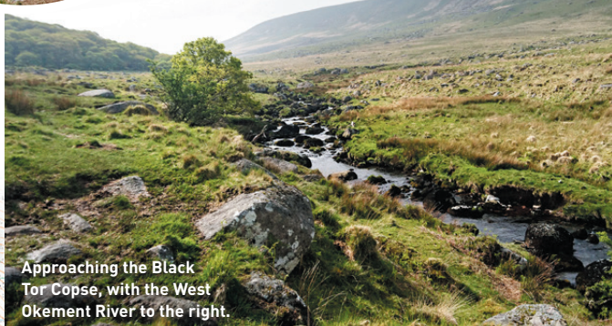
Approaching the Black Tor Copse, with the West Okement River to the right.

well-worn track, heading up the hill with woodland and a large river on your right-hand side. This is where the West Okement River falls to meet the reservoir. As you near the top of the slope, there is a wall of the old water works. Go to the right of this and follow it around until you rejoin the river. Black Tor will now be in view, with Black Tor Copse below it.