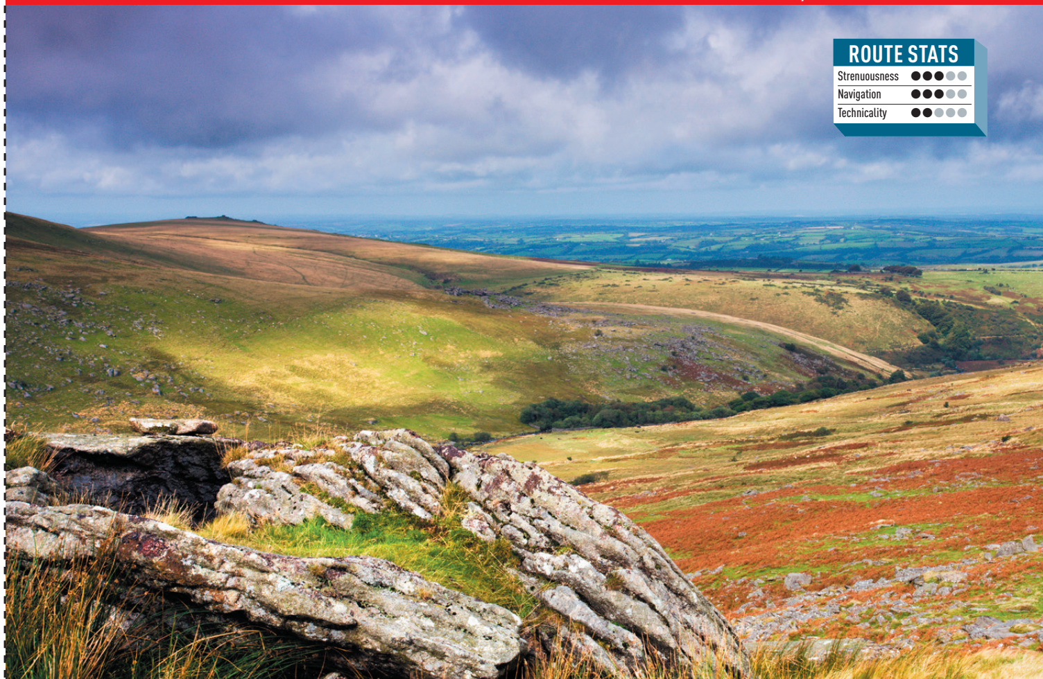
Homerton Hill in north-west Dartmoor, viewed from Black Tor.