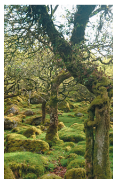
Ancient oak woodland of Black Tor Copse.

Tourist info Okehampton TIC (01837) 53020